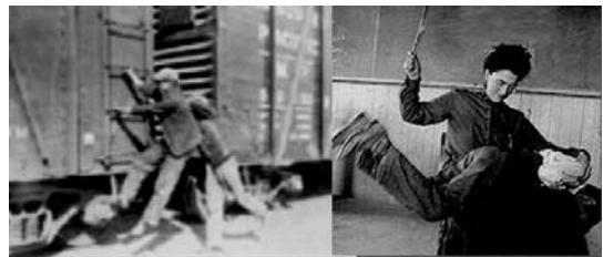
Hitching a ride on the train was a sure spanking