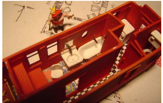
Snappy took these fotos in the shop before the roof was lowered on.