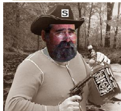
RED MOUNTAIN SOUR MASH

The Outlaw & Kid Durango headin' -up the Million Dollar Hwy. The explosion blew the flatcar clean off the tracks & the team of donkeys were hitched to it.