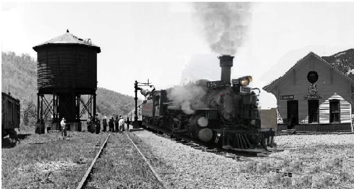
SILVERTON WATER TANK & WATER COLUMN D&RGW RR

Here is the rare photograph - we got an exclusive reproduckshone of it at the SSSG. Whee have more new soon but remember - dares always sumtin hapnin in Silverton.